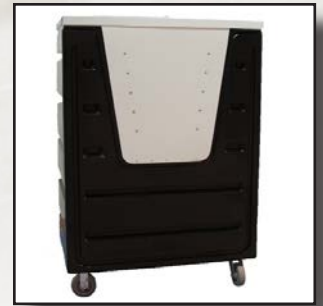
Lid & Door