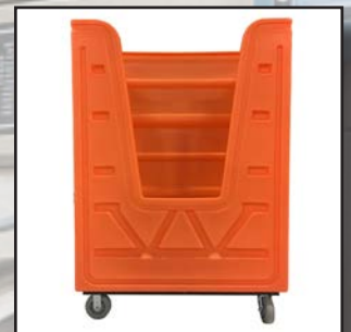
Lower Cut Front